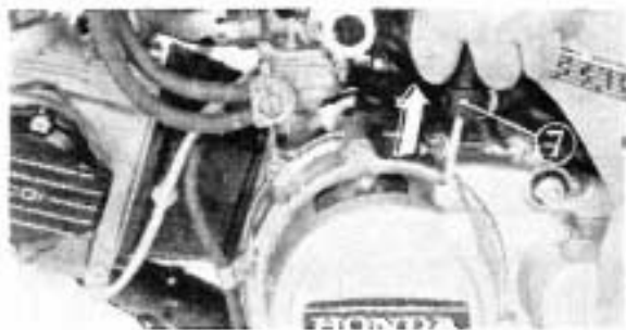
(7) Recoil starter rope