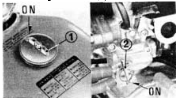
(1) Cap lever