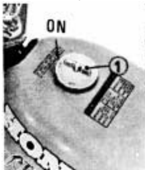
(1) Cap lever